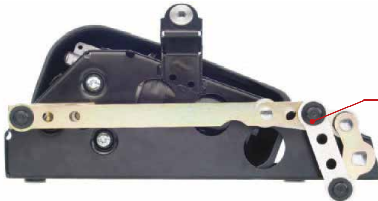
View showing linkage